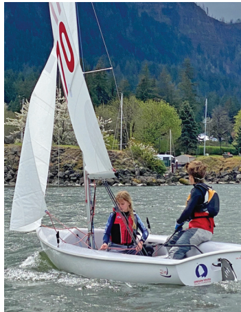
Gorge Sailing Team looking fast in their new Flying Junior.