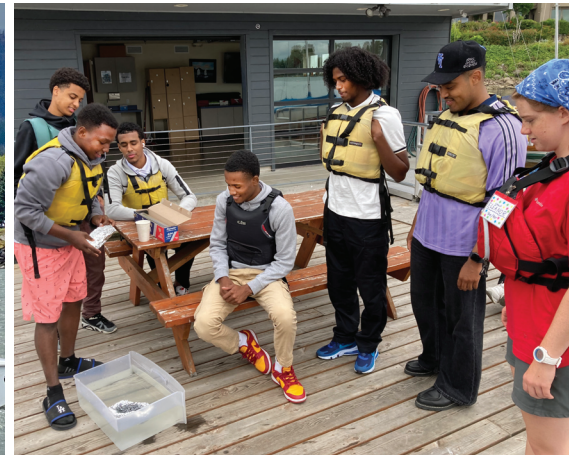
Whose boat will float? Buoyancy experiments with the African Youth Community Organization.

Community Sailing Summer Camps for 150+ students with over 200+ program hours at Willamette Sailing Club. Increased river access and provided job training for traditionally underrepresented Portland Metro youth communities.