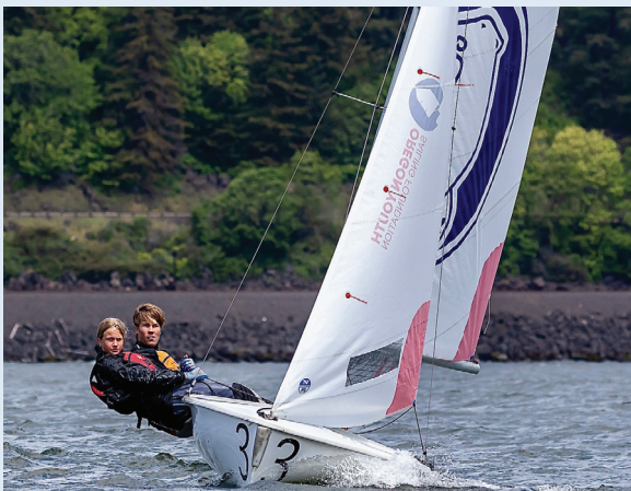
L: OYSF jibs and Polar Seltzer main sails flying at the PNW high school Forest Cook regatta in Hood River.