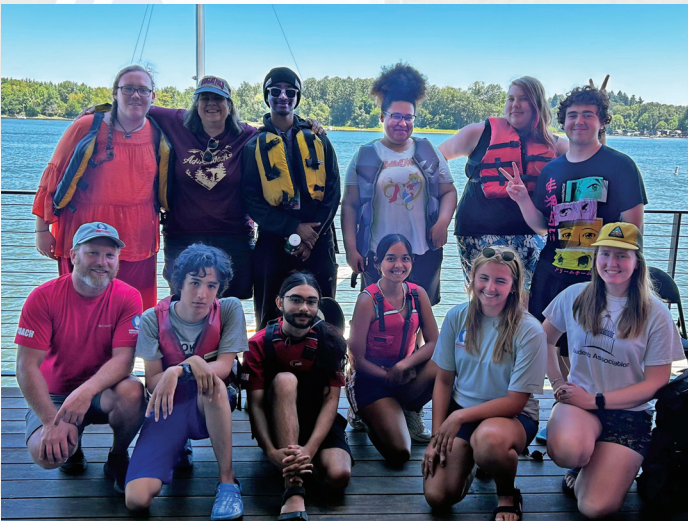
The third summer of sailing and boat building for Portland Opportunities Industrialization Center's "Green Team".