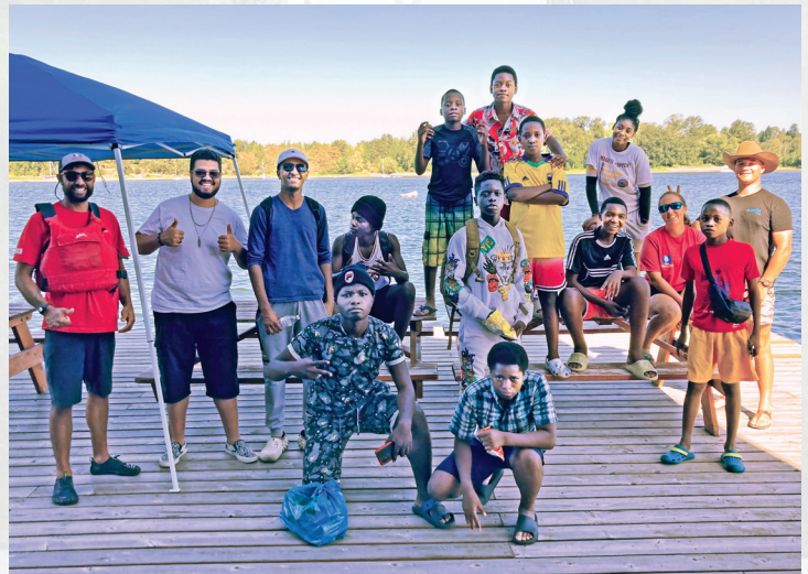
This Center for African Immigrants and Refugees Organization group from Tanzania taught us sailing terms in Swahili and we taught them how to have a great time on the Willamette River.

Oregon Youth Sailing Foundation is a 501(c)(3) non-profit that establishes programs and makes grants for the support of youth dinghy sailing in Oregon. OYSF aims to keep sailing alive and active in Oregon by making it accessible to young people, with a focus on those who otherwise would not have the opportunity to be on the water.