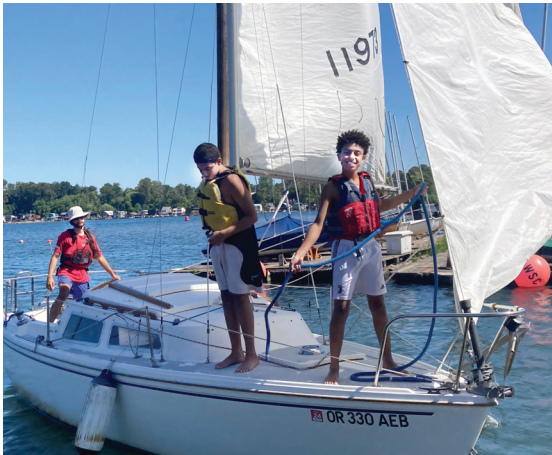
Coming in for a landing on our Catalina 22 Community Sailing vessel Wildfish .