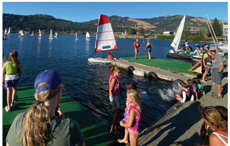
Monday Night Open Sailing at Hood River Yacht Club run by the Gorge Sailing Team.