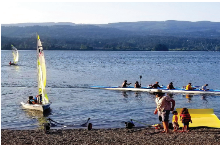
Thursday night Community Sailing and Paddling with the Gorge Canoe Club in beautiful Cascade Locks.

Jackson Foundation Polar Seltzer Portland Yacht Club TK Foundation US Sailing West Coast Sailing