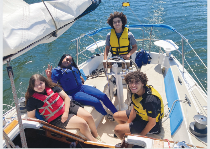
Keel boat cruising day with the crew from iUrbanTeen.