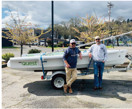
Oregon Boating Foundation in Newport, OR now has an RS Quest for their youth and adult summer programs.