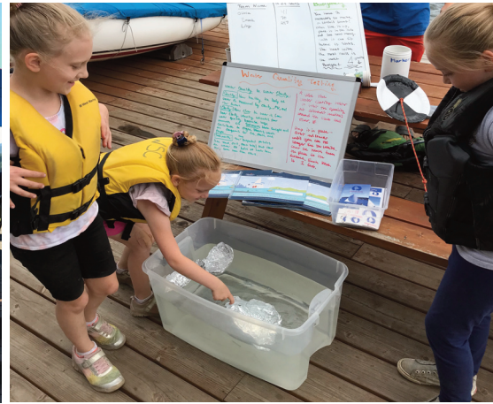
Enjoying a buoyancy competition and some maritime science at the 2021 RiversWest Family Boat Build and Sail-a-Small-Boat-Day.

Community Sailing and Boat Building Summer Camps in partnership with Wind & Oar Boat School. Increasing water access for traditionally underrepresented PDX youth