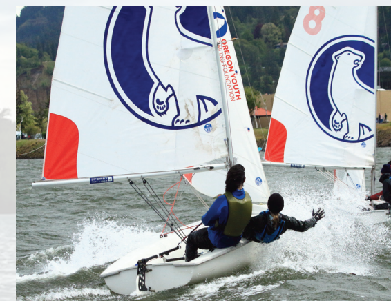
Polar Seltzer mains and OYSF jibs getting a workout at a high school regatta in Hood River, OR.