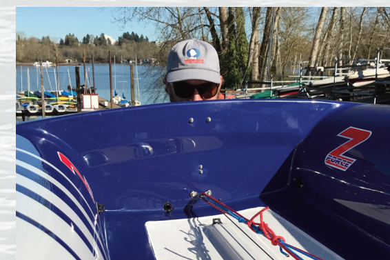
Six brand new, super fast Z Force Zim C420s for Willamette Sailing Club in Portland, OR.

Anyone who loves sailing knows it strengthens both the body and the mind. It teaches teamwork, problem solving, and appreciation for the outdoors. It builds confidence and life skills. Teaching young people to sail on their own empowers them and fosters independence. Oregon Youth Sailing Foundation seeks to share the joy of sailing, with the ultimate goal of developing lasting relationships and encouraging youth to stay connected to the water.