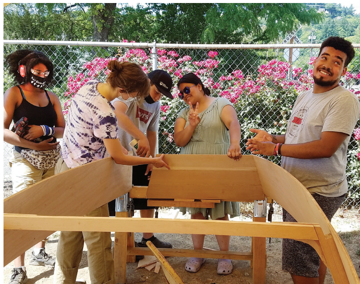
The Green Team from Rosemary Anderson High School trying to get their transom finished at the OYSF/Wind & Oar Summer Boat Building and Community Sailing Camps in Portland, OR.

ILCA Laser raffle fundraiser in partnership with West Coast Sailing