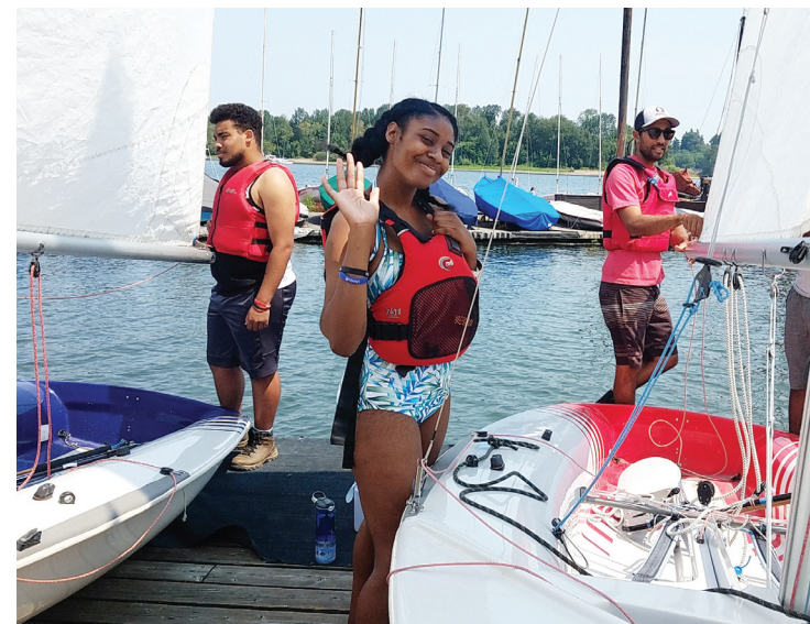
Rigging up for a beautiful summer sail on the Willamette River during our 10 weeks of the Community Sailing Program.